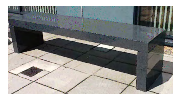
U shaped Bench seat