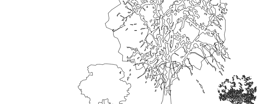
Planter type BPL